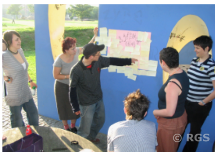
Members of the Get Bent! collective plan the event at an open-air meeting in Hulme, in June 2007.

Everything was free to attend and the aim was to hold many of the events away from alcohol.